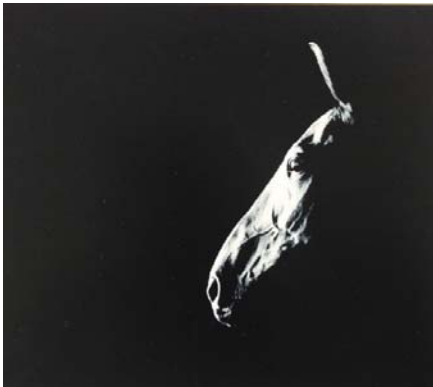
Aneliese Gibson—Digital Photography